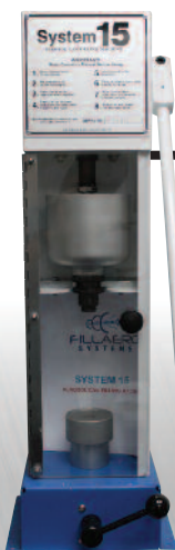
Z-1501 Hand Operated Fill Machine

Z-100: Flexible and portable. Easily add a second component to Seymour's pre-charged custom fill blend cans at time of application. No mess or extensive cleaning. Reusable.