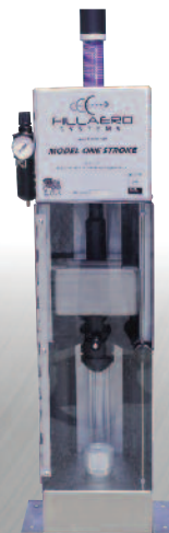
Z-2001 Pneumatic Fill Machine