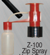
Z-100 Zip Spray Hand Pump Filling Tool