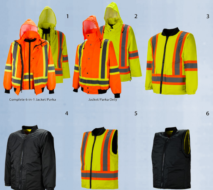
Complete 6-in-1 Jacket/Parka