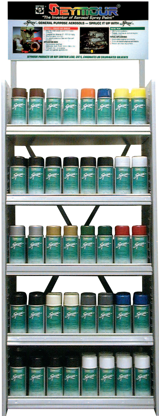
Z-240 Display Center