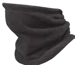
Neck Warmer / Face Mask