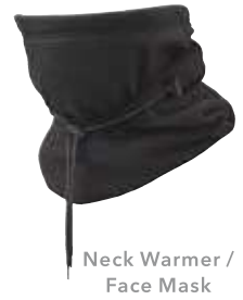
Neck Warmer / Face Mask