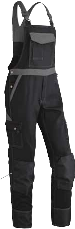
Cordura®-reinforced knees and ankles